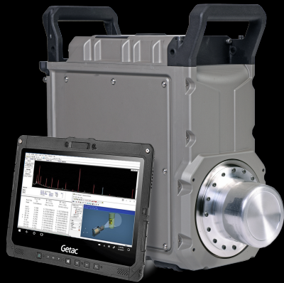
Aegis Portable HPGe Spectroscopy

More new and featured products this year.