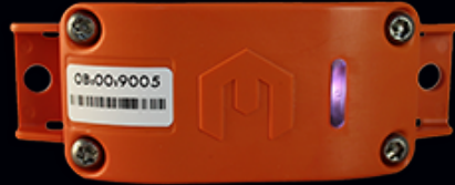
ORION Asset Tag