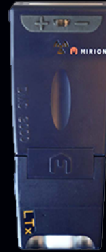
DMC 3000 LTx Module