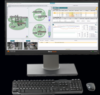
ORION Studio Software