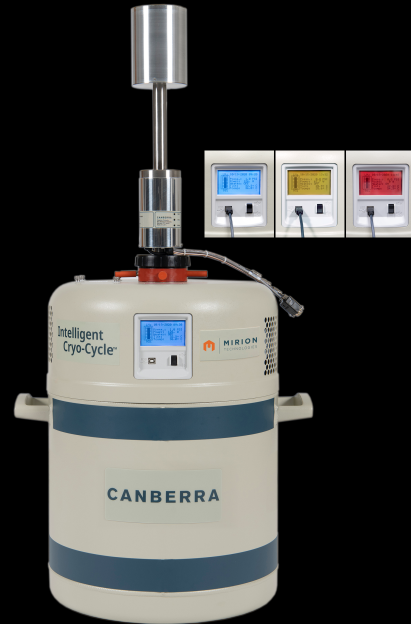
Intelligent Cryo-Cycle Cryostat