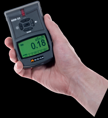
RDS-32 Survey Meter