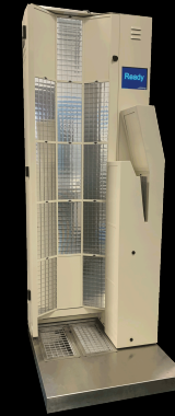
Argos-3 Compact Body Contamination Monitor