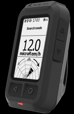
AccuRad Personal Radiation Detector